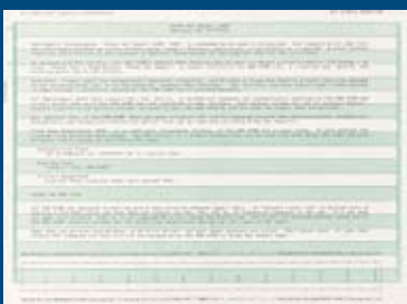
Report printed on an HP LaserJet printer using standard cut sheet paper

The default settings will generate green bar reports that are appropriate for most applications. If, however, you need to alter printout features such as line coloring or spacing, you can easily do this via the pull-down menu. For sensitive documents and added security, this menu even includes a Private Job function. When used in conjunction with HP LaserJet printers supporting Private Print, Private Job gives you the ability to secure documents with a pin code; the document will be sent to the printer, but it will not be released for output until an authorized user enters the correct pin code into the printer's keypad.