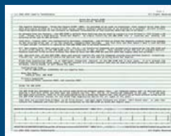
Report printed on an HP LaserJet printer using standard cut sheet paper